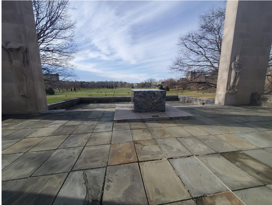
③ VIEW TO THE WEST