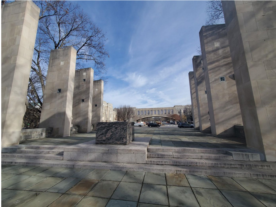
① VIEW TO THE EAST FROM MEMORIAL COURT