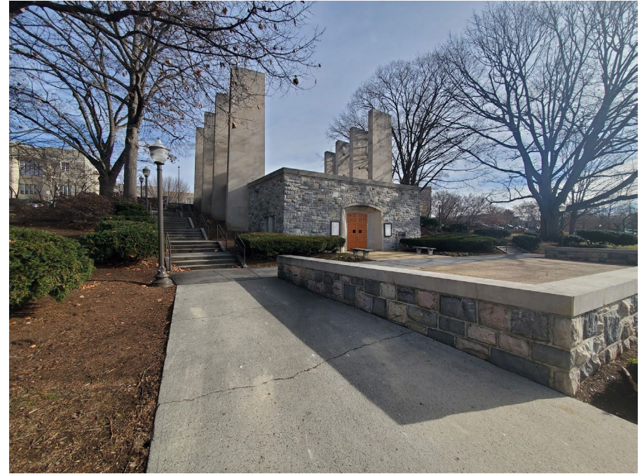
④ VIEW TO THE EAST FROM THE DRILLFIELD