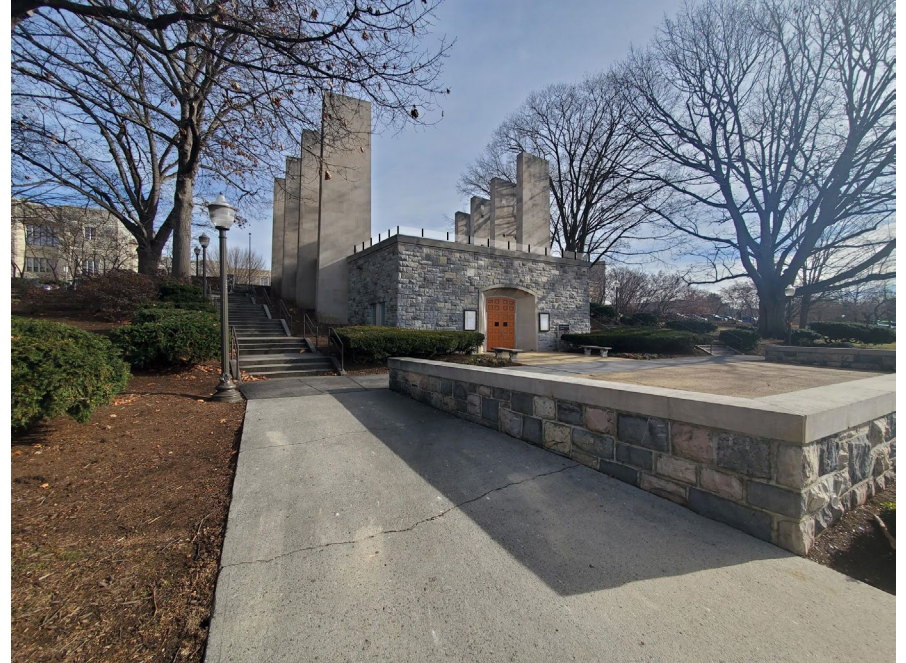
VIEW TO THE EAST