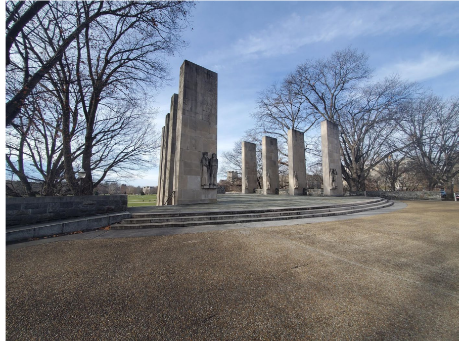
② VIEW TO THE WEST FROM DRILLFIELD DRIVE