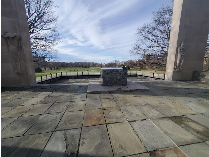
VIEW TO THE WEST