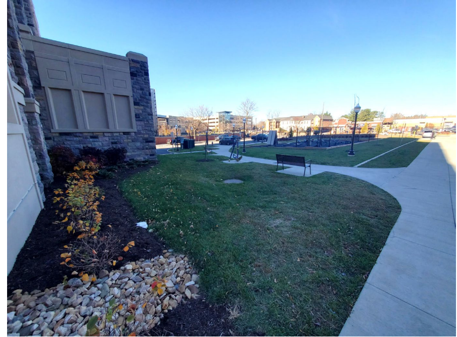
② VIEW TO THE NORTHEAST