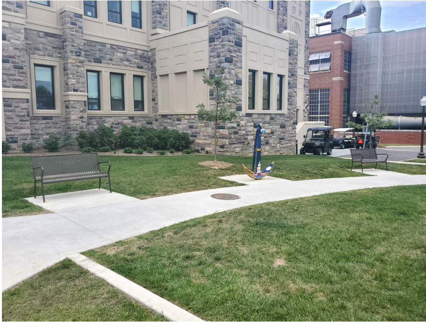
① VIEW TO THE NORTHWEST