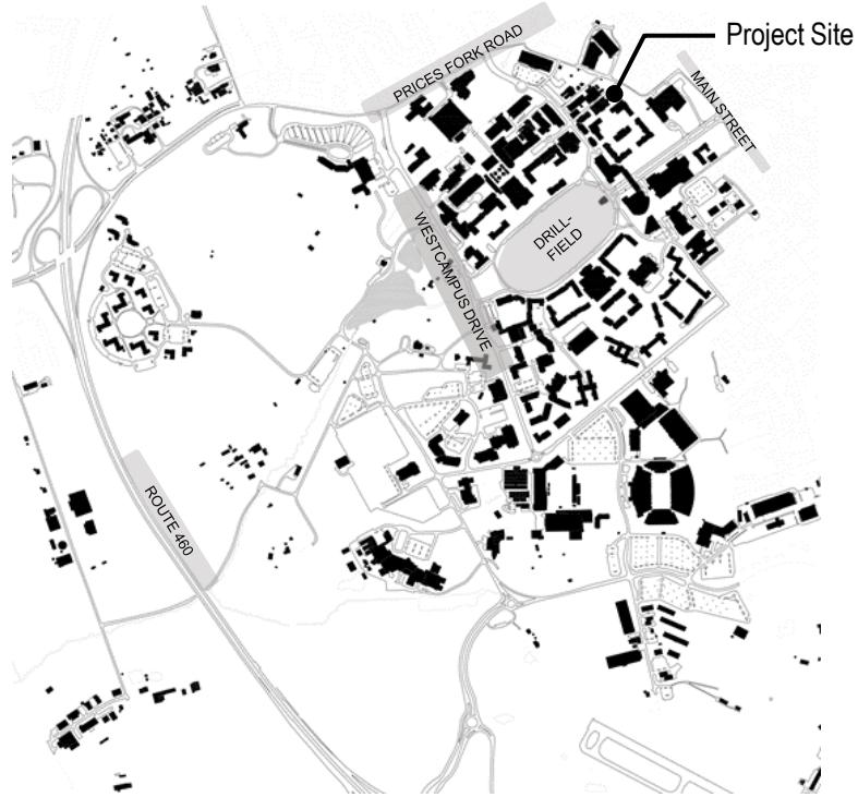
BLACKSBURG CAMPUS MAP